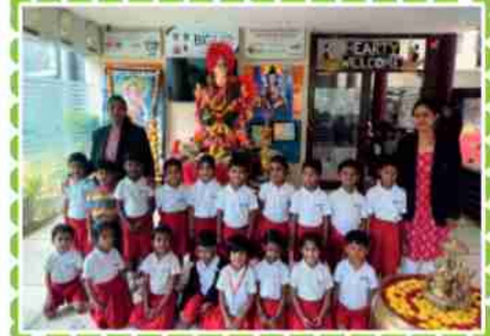
Ganesh Chaturthi Celebration: Ganesh Chaturthi is a popular Hindu festival celebrated in honour of Lord Ganesha, the god of wisdom, prosperity, and remover of obstacles. (UKG D)