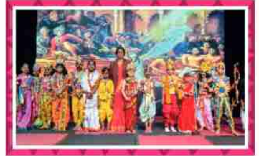
Fancy Dress Competition: A Fancy Dress Competition was held at BIA state on 30th July Children dressed up in their colourful costumes of their favourite characters from Ramayan and Mahabharat spoke a few sentences on the character that they depicted.