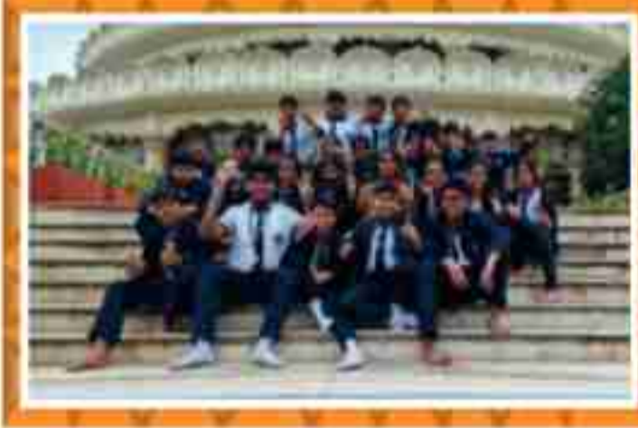
A day of peace and discovery at Art of Living.