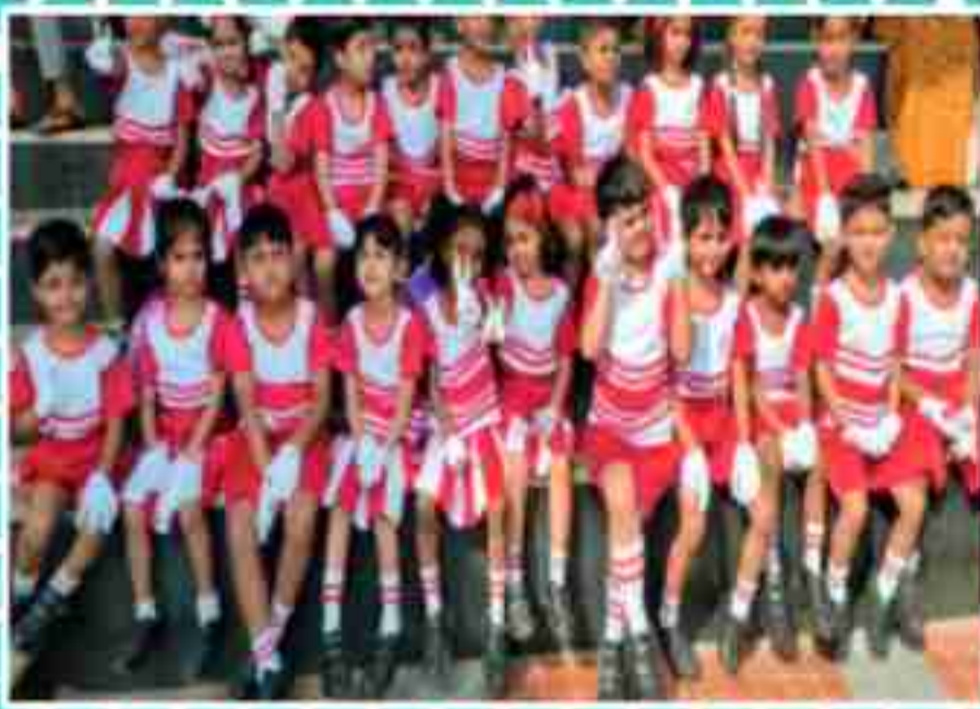
Annual Sports Day - Olympus 2025 : Our annual Sports Day is here, bringing together the spirit of competition, teamwork, and fun! Let's cheer on our champions as they push limits, break barriers, and make memories! " (UKG C)