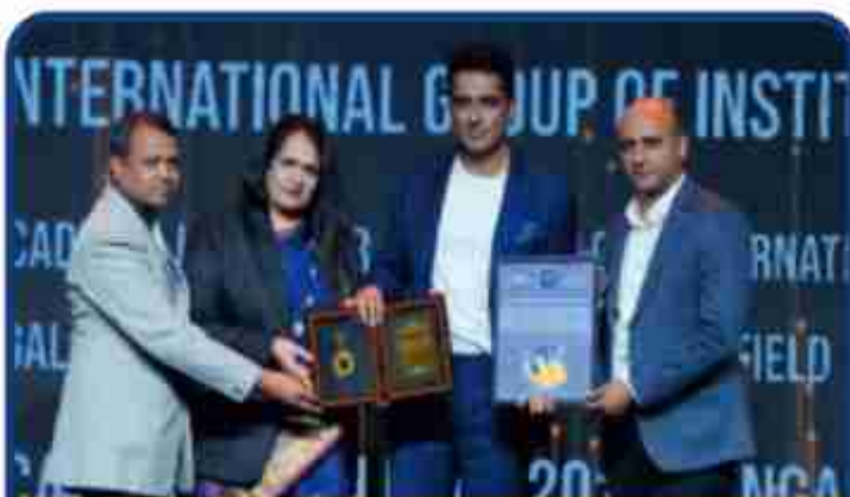
Bangalore International Academy Winning the Times Award for Best School