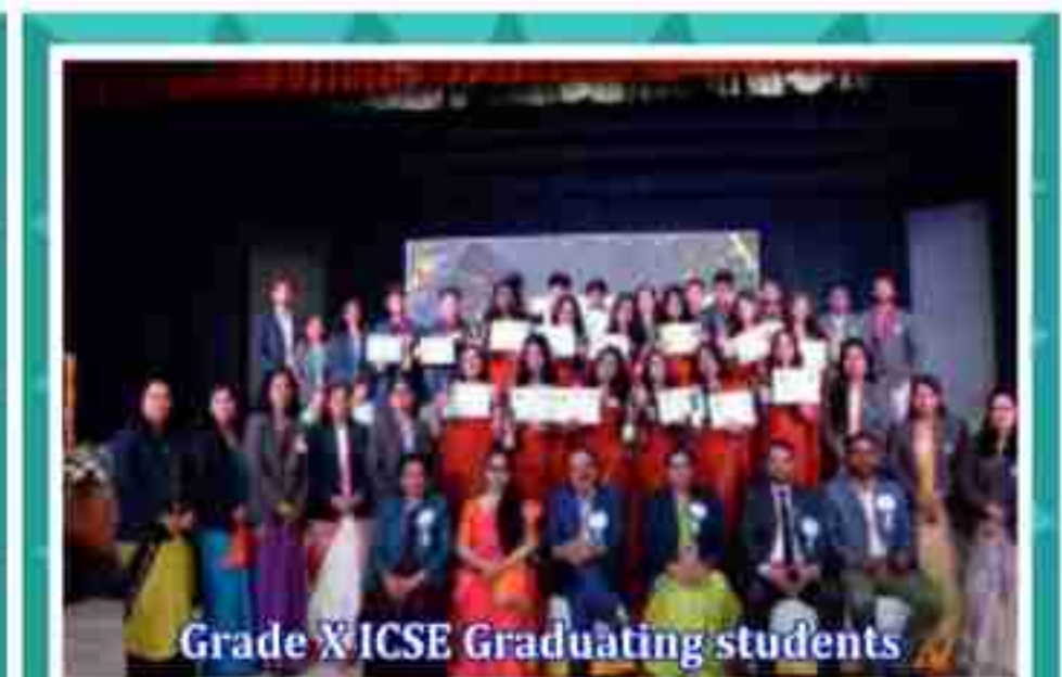
Grade X ICSE Graduating students