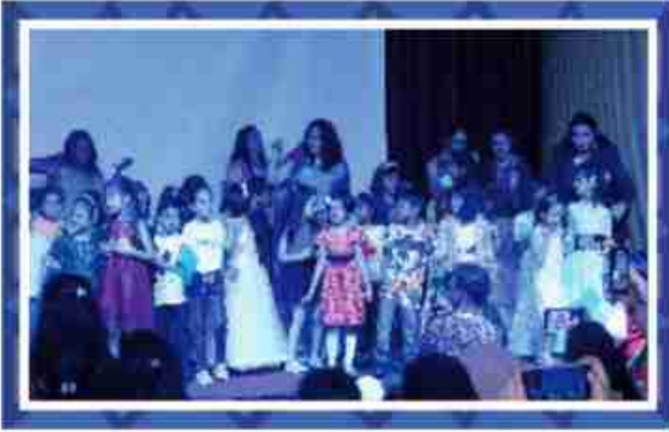
Magic of Mothers' Day Celebrations