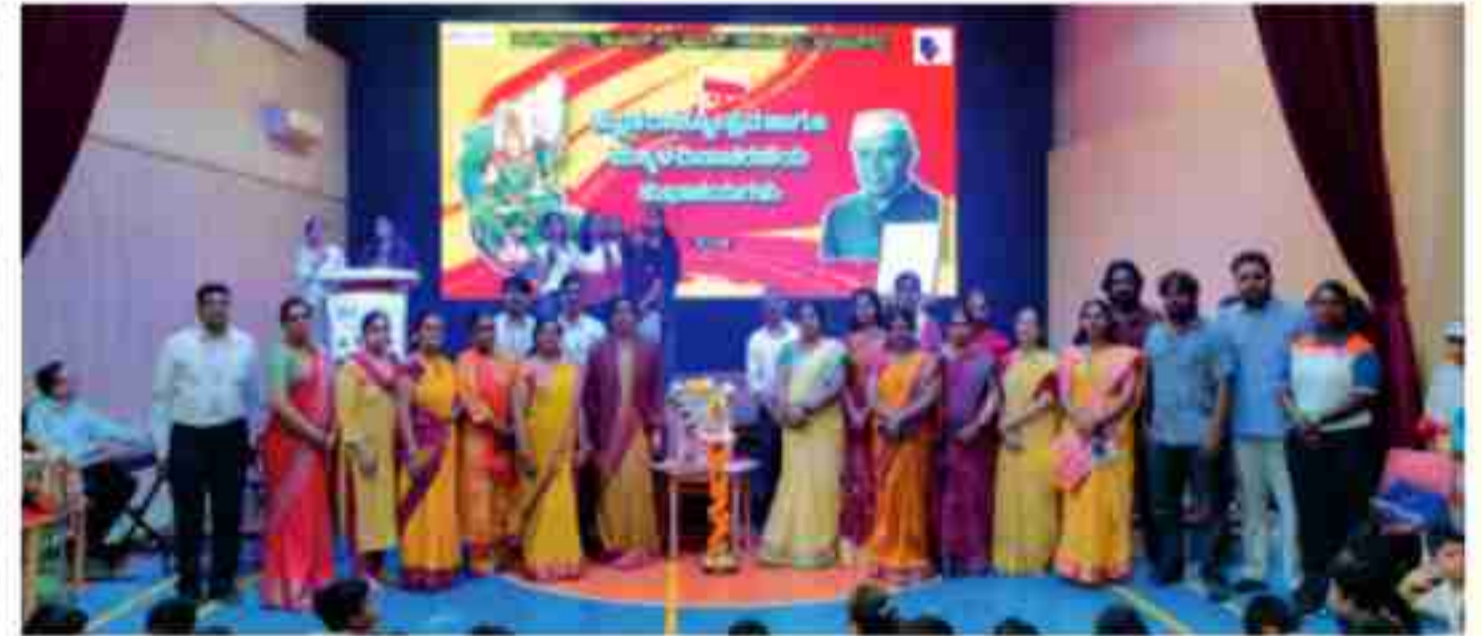
Kannada Rajyotsava and Children's Day was celebrated on

BIGI Sports Day Olympus 2025: Sports Day an event to promote physical fitness by sportsmanship among students was conducted on at Kittur Rani Gennamma Stadium. It was a Grandeur with alluring March Pasts, Scintillating performances and Displays, the relays and races and finally the prize distribution was the highlight of the Day.