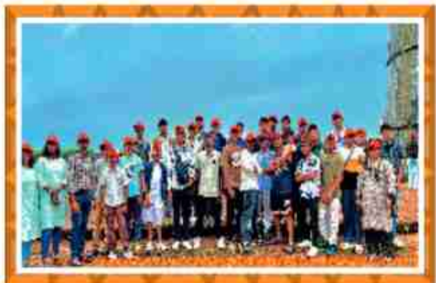
AN EXOTIC TRIP TO GOA AND DANDELI! : The children had a thrilling experience of River Rafting at the Kali River Dandeli. The alluring beaches, fascinating churches and Forts of Goa enthralled the children. The mesmerizing cruise with grooving Goan music, the captivating sunsets and Goan delicacies left the children with the fond memories of a pleasurable trip.