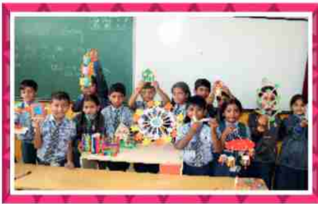
The class activities conducted during the Academic Year 2025-26.