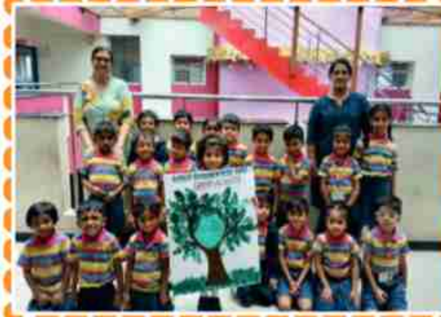
Environment Day Celebration: Environment Day is celebrated on 5th June every year. It is a day to spread awareness about protecting the environment. (UKG-B)