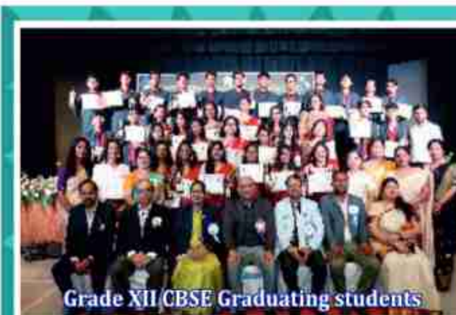
Grade XII CBSE Graduating students