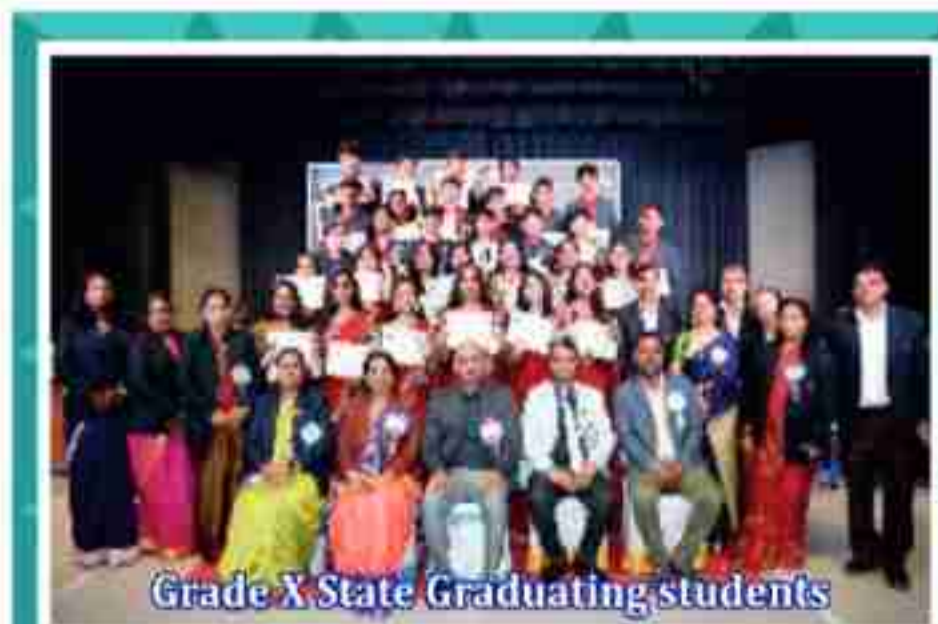
Grade X State Graduating students