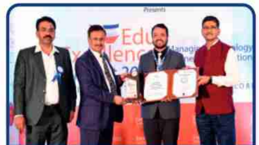
Bangalore International Academy Winning the Most Progressive School Award from CBSE & CED