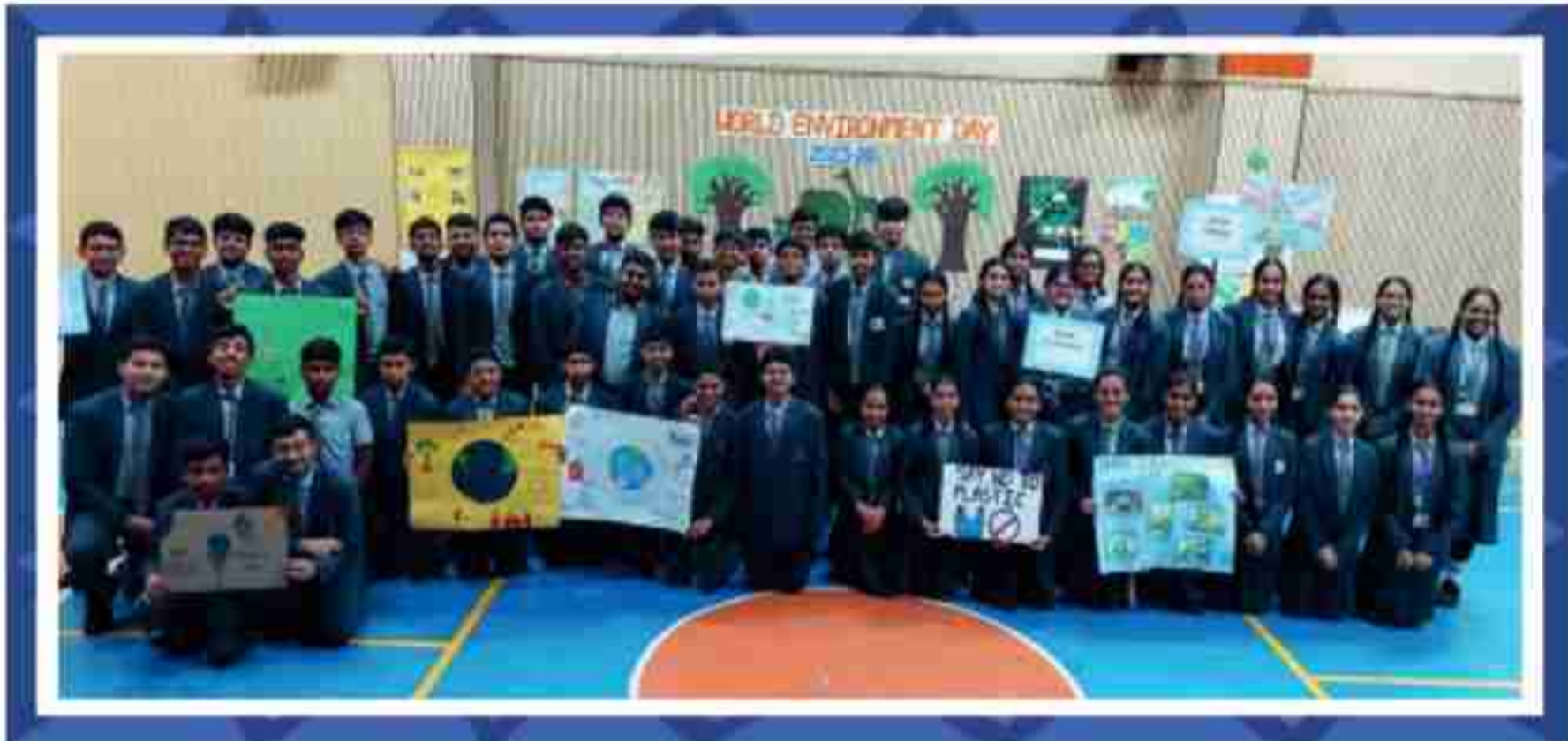
One Earth, One Chance! : The World Environment Day was observed with great joy and enthusiasm on 5th June 2025 by BIA State Wing.