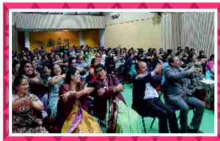
Teachers' Training in progress

Big Events & Activities @ BIGI - a Galaxy of Activities: BIGI is a mini world of activities with a blend of beauty, energy, enthusiasm & elegance. The BIGI with all the wings together celebrated a few events with great pomp & show. The four wings of BIGI namely Shining Stars, CBSE, ICSE and State are always busy engaged in a number of activities throughout the year.