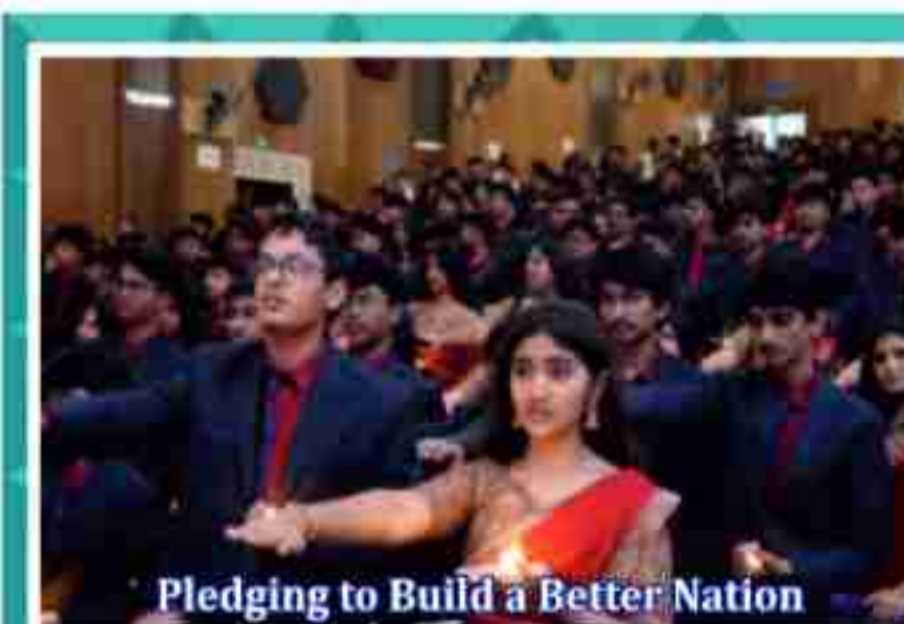
Pledging to Build a Better Nation