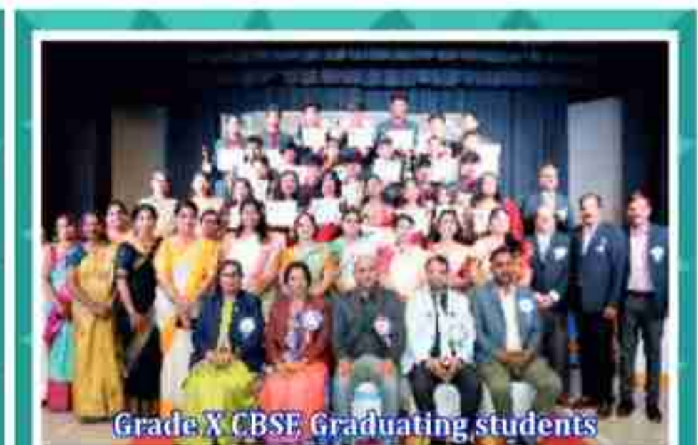
Grade X CBSE Graduating students