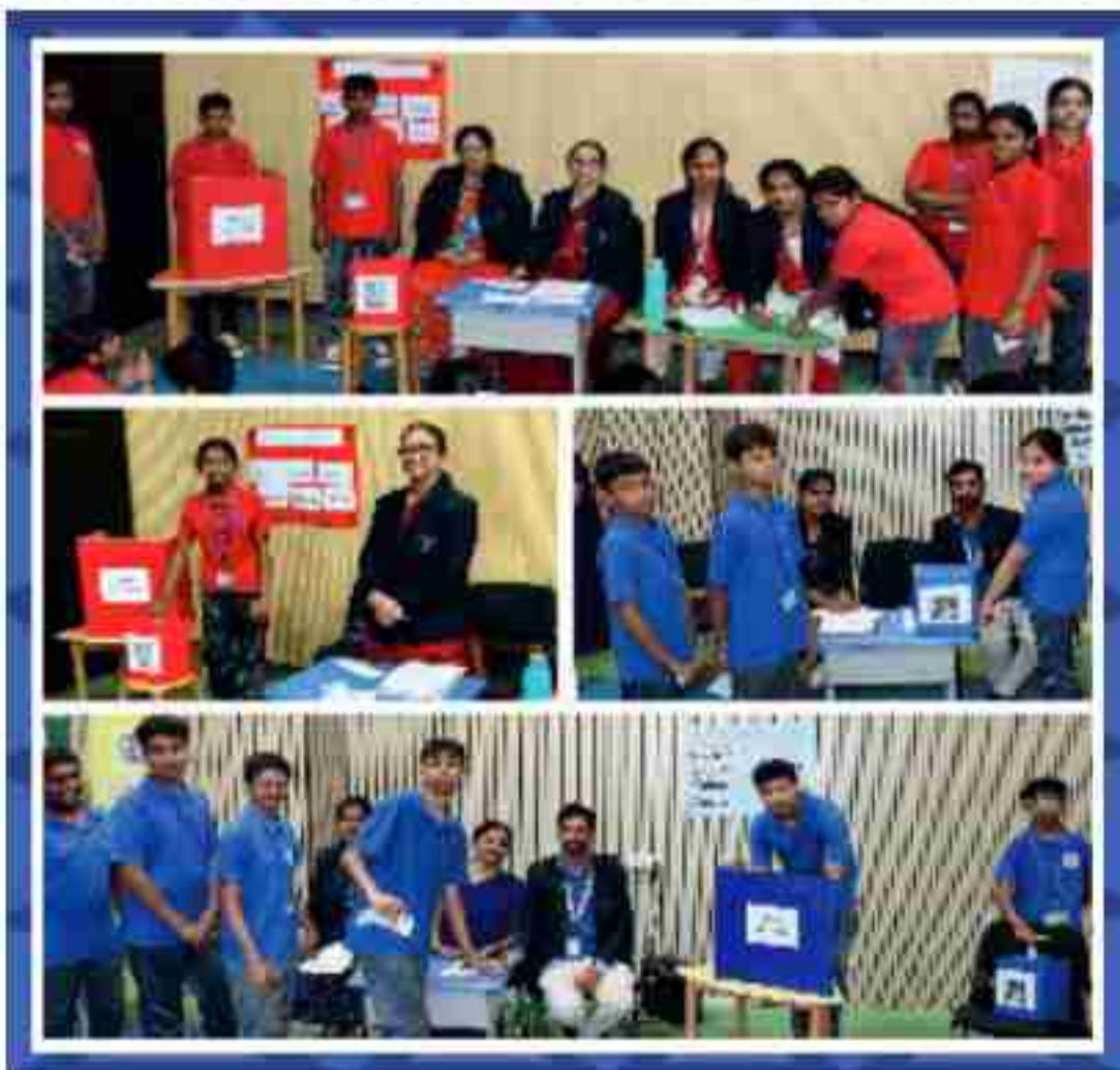
Election For Student Council: "Casting a ballot isn't just something you do for yourself- it is for our collective future".*

The Student Union Election for the selection of House Captains and vice captains- for the Academic Year 2025-26 was held on 2nd July.