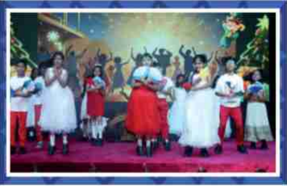
Lit & Cul Activities