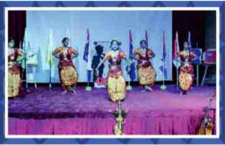
Lit & Cul Activities