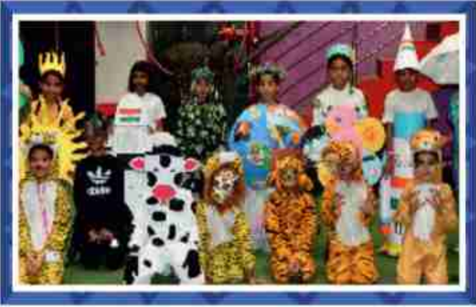
Fancy Dress Competition