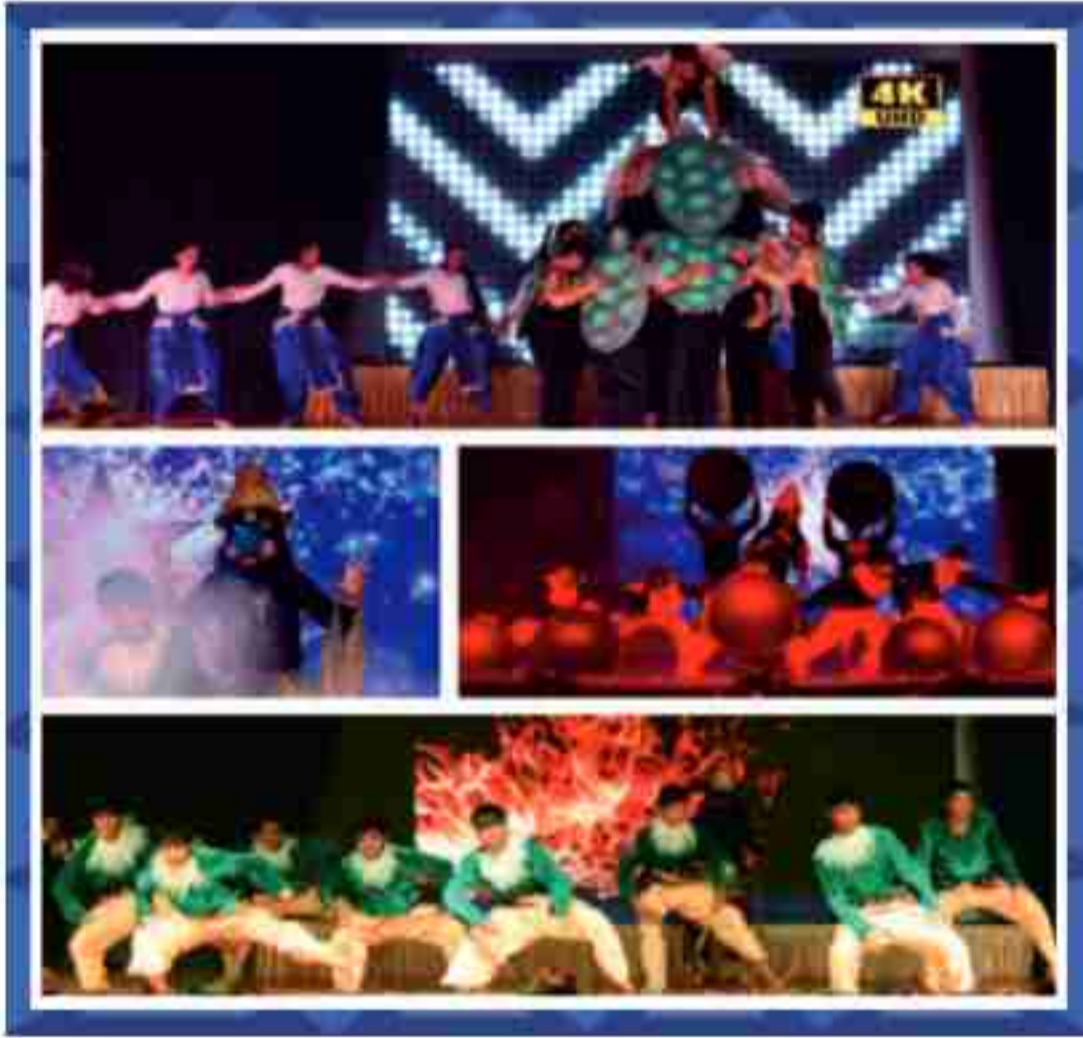
Annual Day Celebration of BIA State Wing held on December 1st 2024.