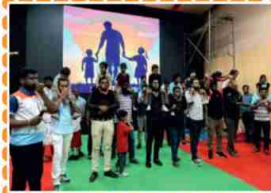
Father's Day is celebration: Father's Day is celebrated to honor fathers and father figures for their love, care, and guidance. (UKG D)