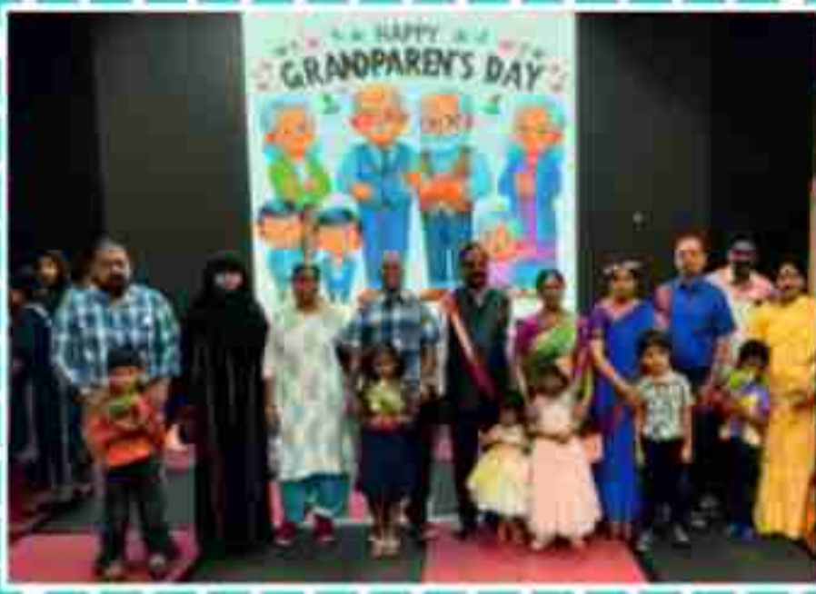
Grandparents' Day Celebration: Grandparents' Day celebrates the special bond between grandparents and grandchildren. (UKG-B)