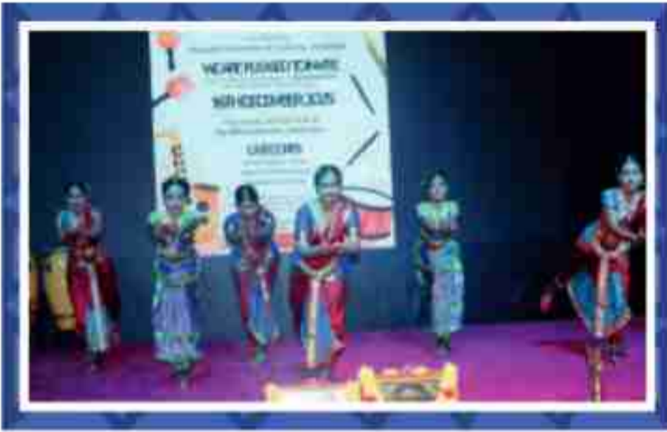
Lit & Cul Activities