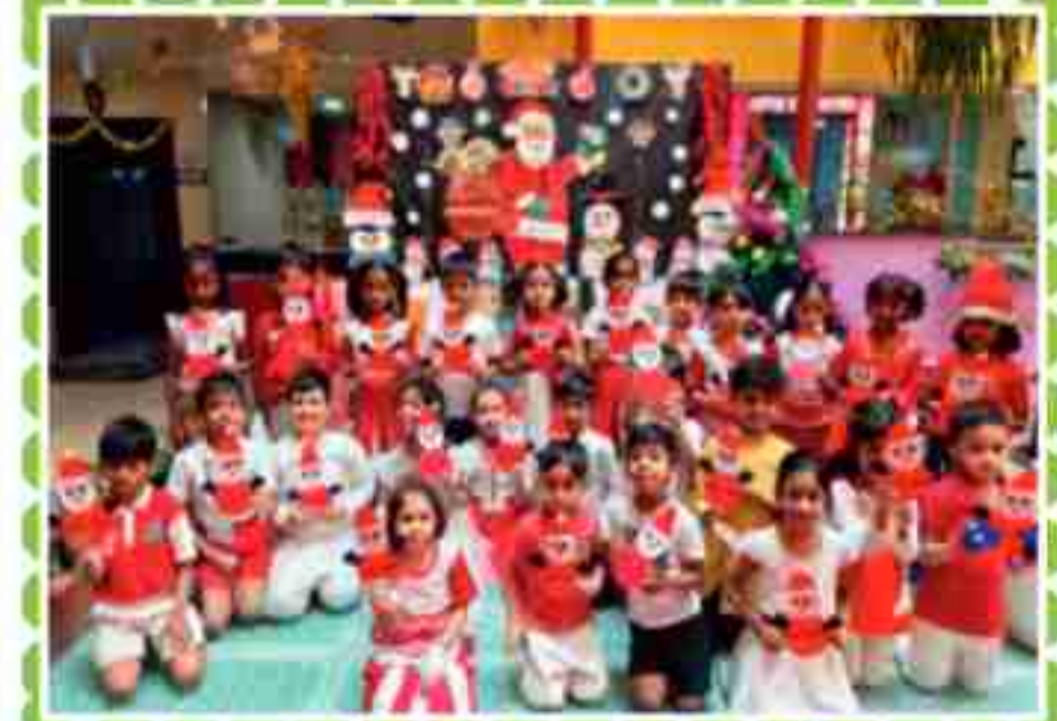
Christmas Celebration: Christmas is a joyful global festival spreading messages of love, peace and goodwill worldwide. At BIGI we celebrated by exchanging gifts. (UKG -E)