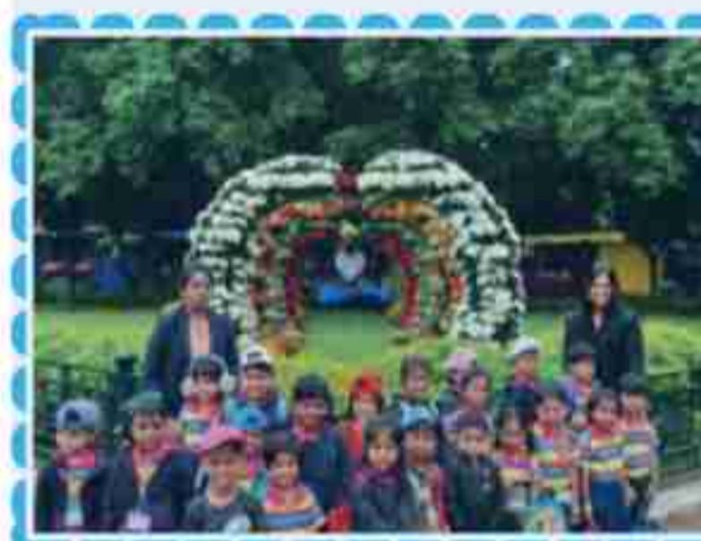
Field Trip to Lalbagh: "Field trips are an opportunity for one to enter into the world of mystical power" The Grade LKG A students from BIA, embarked on an exciting field trip to the magnificent Lalbagh Botanical Garden, Bengaluru. Children showed excitement watching grafted plants, towering trees, climbers and ferns. They also visited Glass house with stunning Flower Show displays and artistry. Children learnt about horticulture and connected with nature.