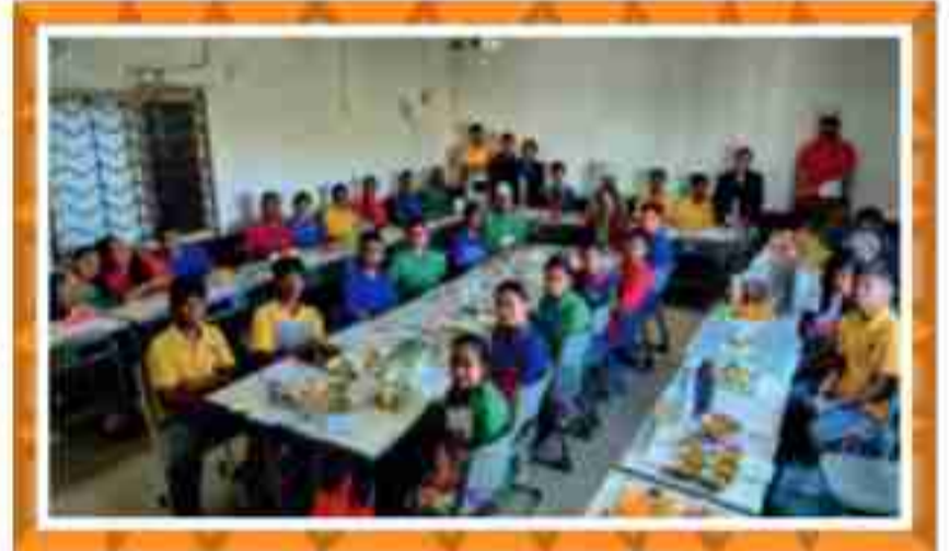
Glimpses of cooking without fire held during the month of December 2025