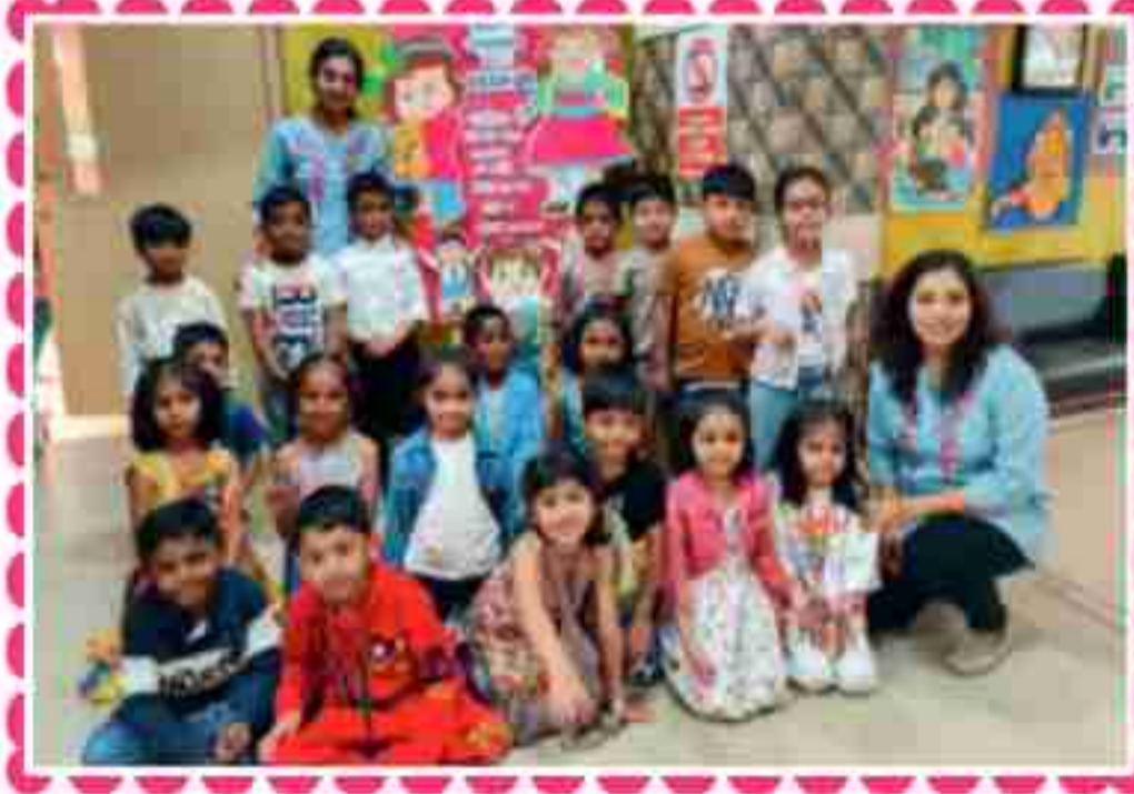
Children's Day Celebration: Children's Day in India is like a big hug for kids, celebrated on November 14th, Nehru's birthday! He's a big reason why kids have such a special place in India's heart. Schools go all out with cultural programs, games, and gifts, all about celebrating childhood innocence and making sure kids have opportunities to grow. (UKG C)