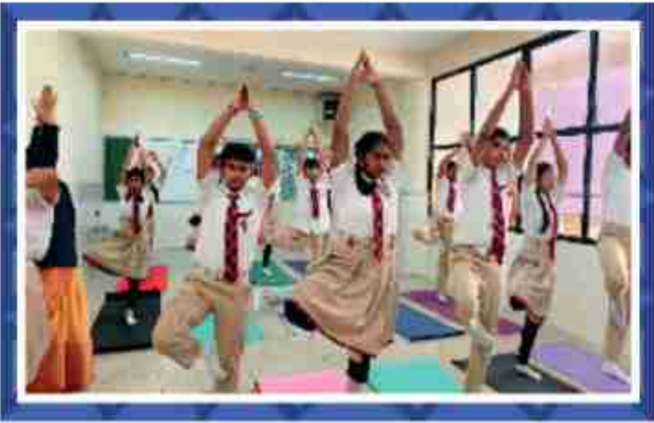
Yoga : Exercise for mind & body