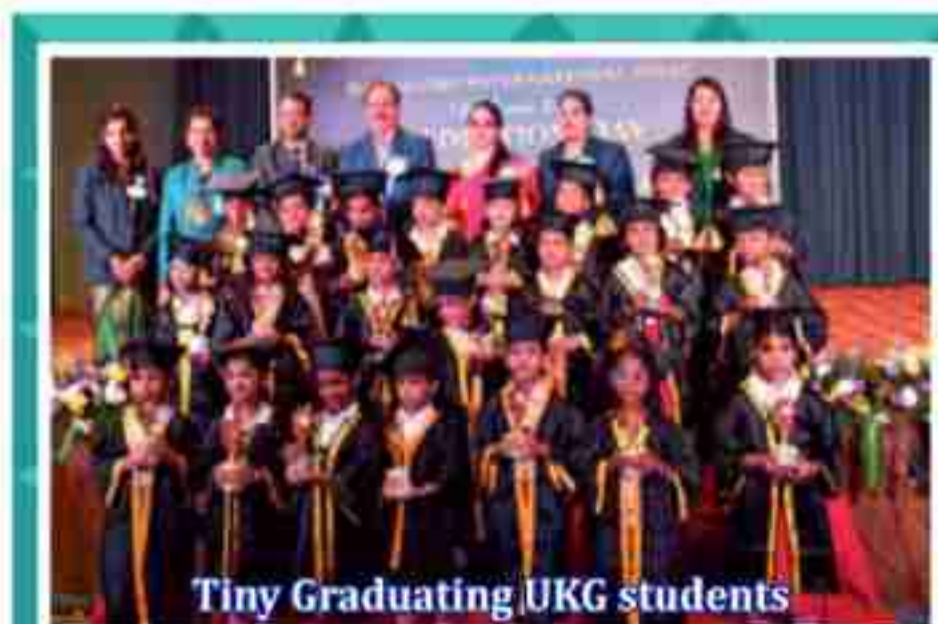
Tiny Graduating UKG students